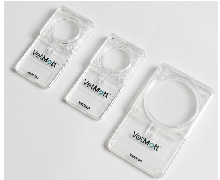
VME0850 (850µl) and VME03000 (3ml)

Our devices have been commercialized for use in human fertility clinics as ZyMöt® Sperm Separation devices since 2015.